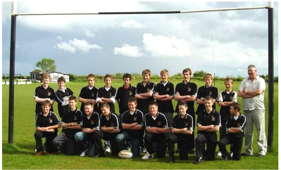
Sgwad rygbi ieuenctid Pentyrch

Mae croeso cynnes i unrhyw chwaraewr ifanc 14 oed ymuno â'r tim llwyddiannus hwn – cysyllter â 02920 890979