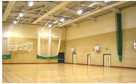
The Sports Hall