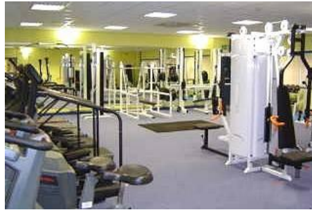
The Fitness Suite

As part of Radyr Comprehensive School a new Sports Hall has been built which is open to the public. The hall has facilities for many indoor games including football, tennis, badminton and basketball and it also has a large fitness suite.