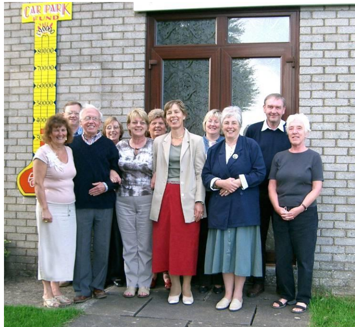
Pentyrch Village Hall Committee